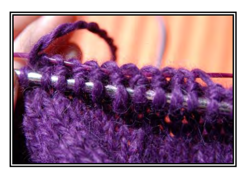
Rnd 24: K24, *K1, YO* around Rnd 25: K25, sl YO to holder in back of work, *K1, sl YO to holder in back of work * around

(Note: You can do the YOs directly onto your holder by looping the yarn over the holder in back then knitting the next stitch as normal. Then just knit round 25 normally.)